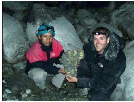
Crew member and Joshua Gates

• The tracks found in the Himalayas by the TV show "Destination Truth."