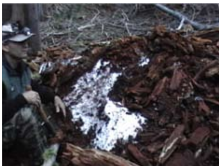
Robert Leiterman with bark covered snowmound

• Mysterious ice mounds being discussed at length on the BFRO forum. To learn more: www.bfro.net/news/roundup/sierras_2005_snow_mounds.asp