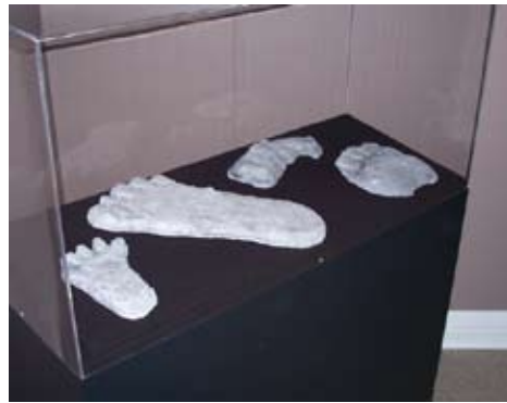
Casts on display at the exhibit