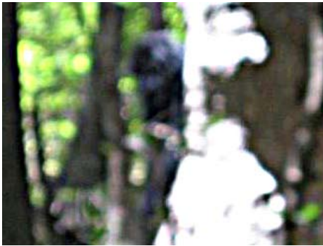
Another view of the Pogonip "creature."

Now that we're in the heart of Winter, bigfoot reports tend to slow down as most folks stay inside where it's warm and cozy rather than traipsing around out in the woods. So I thought I'd go back and look at the "Pogonip Bigfoot" incident again.