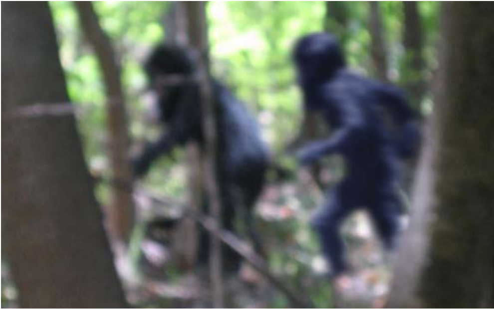
The Pogonip Bigfoot side-by-side with the Bigfoot Discovery Day streaker, composited in Photoshop. Photoshop composite by Mike Rugg