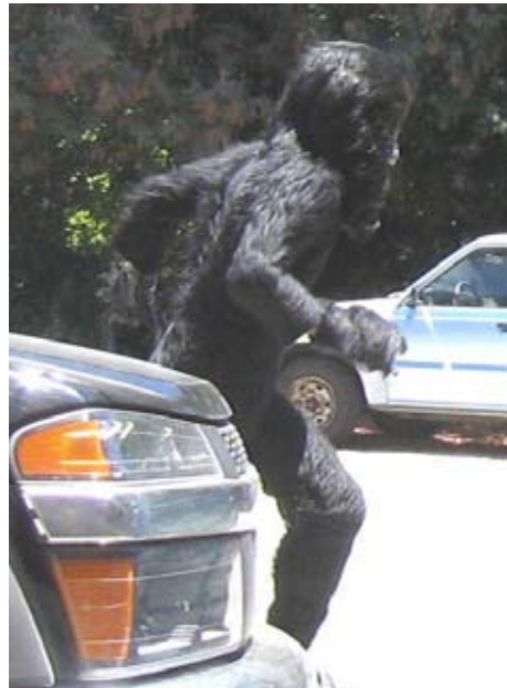
Bigfoot Discovery Day "streaker."

When I first received the photos I looked at them as suspicious, because they bore no resemblance to the P/G Bigfoot. Also I had noticed some similarity between the Pogonip creature and the streaker, below.