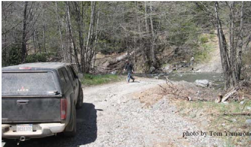
Cliff inspecting a creek crossing along the forest road.

There were 25 people out here this weekend and the group split up to camp in several different locations. We were in a small, unoccupied campground and had the place to ourselves due to the fact that we just opened the road. I was camped with museum members Bart Cutino and James "Bobo" Fay, along with visiting bigfooter Stan Courtney