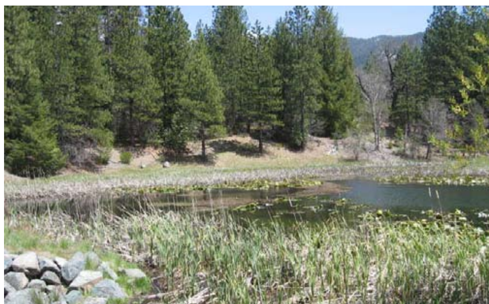
View across the lilly-covered lake