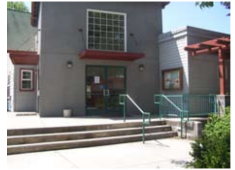
Felton Community Hall. 6191 Highway 9