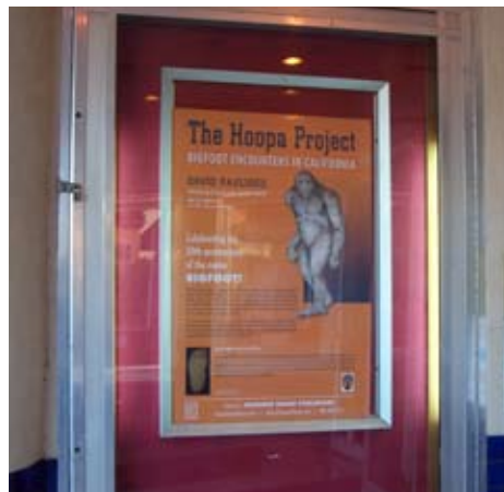
The poster out front in the entrance

When I began taking notes he was talking about the Bluff Creek area and the Hoopa Valley. He began his research to find a study area on the internet, like many of us do, reading reports on the various databases. Using his experience in the business world to collect and collate bigfoot accounts, he was able to reproduce statistical reports that would narrow his geographic search for the optimal research area. He focused his search in California, Oregon and Washington and soon had statistics for reports in every county of these states. Humboldt County in northern California registered a high number of bigfoot sightings and within this region, Willow Creek, CA stood out as the bigfoot capital.