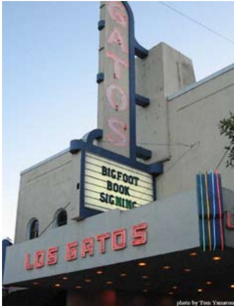
The marquee at the Los Gatos Cinema