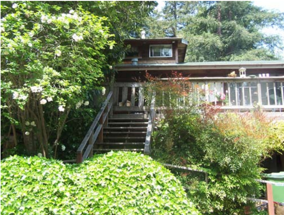
The main entrance to the soon to be available for rent Bigfoot Discovery Lodge in south Felton.

Now that we've nearly vacated the main floor of the riverside cabin we call home to make way for the "Bigfoot Discovery Lodge," we're looking forward to the summer ahead. As soon as the 4th of July weekend we hope to have the place ready for summer rentals. Once this occurs we have high hopes that the revenue stream will finally be enough to fund the Bigfoot Discovery Project and Museum, so we can get seriously committed to the work of solving this mystery once again.