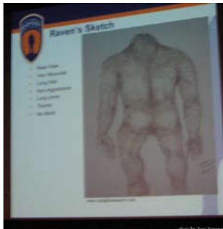
Slide showing a police artist's sketch ( T. Yamarone )

David then told the audience about a unique aspect to his book – he employed a police sketch artist to meet with the witnesses and produce an image of the creatures. You will be surprised by these images as the facial features appear to be very human-like. He displayed a few of the images and stated that he feels there are two genetic strains within the bigfoot population – one that is more ape-like (like the subject in the P-G film) and one that is more human-like (as these ones sighted around the Hoopa Valley appear). He implied that there has been interbreeding of the native peoples and the bigfoot population nearby. He even boldly stated that “things have gone on with native women that aren't cool to talk about” and stated we would have to wait 10 to 12 months for the second book to find out just what has happened.