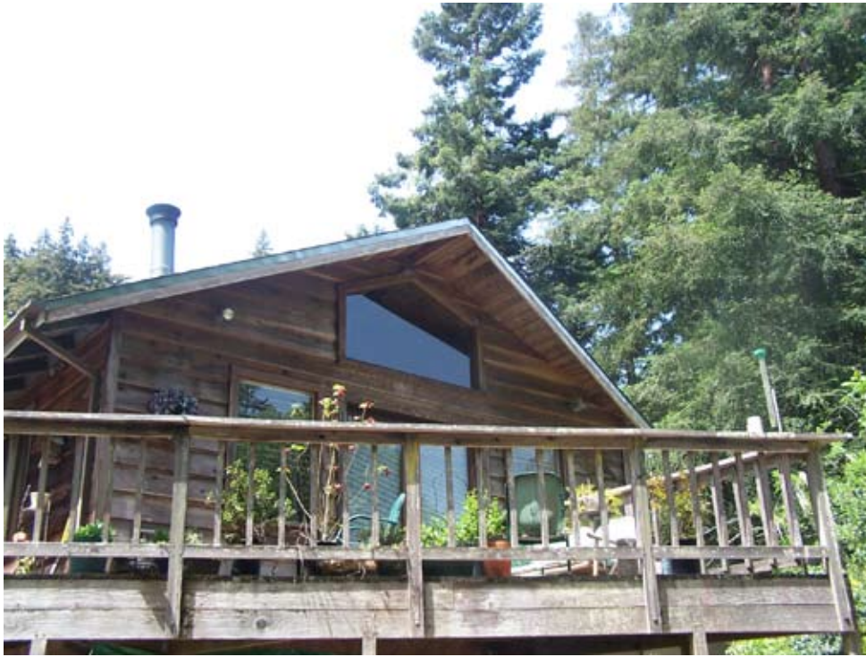
The lodge as viewed from the top of the levee just above the pathway to the river.