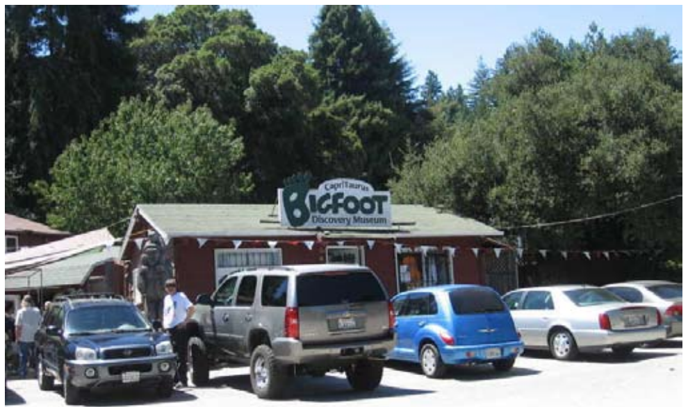
Bigfooters arriving at the Discovery Museum on Friday afternoon, August 8, 2008