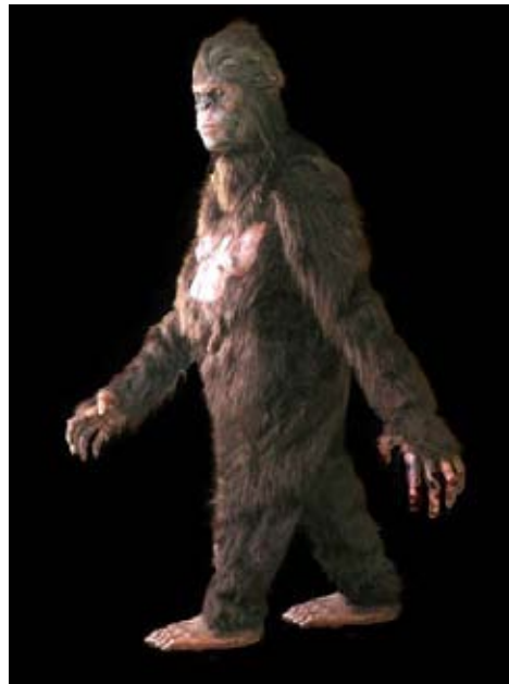
The Bigfoot costume they used for the hoax