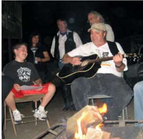
Fun around the campfire

outstanding especially since we were also able to gather at the newly opened Bigfoot Resort. That allowed all of our local researchers and friends from the area to be together with our guests in a comfortable setting in the Great Room, on the deck and around the grounds..