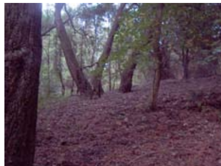
The area off Trout Gulch Road we investigated