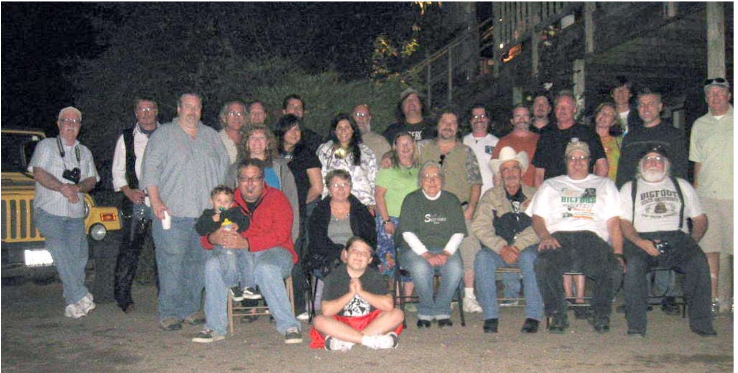
Bigfoot reserchers at the Bigfoot Resort on Friday , August 8